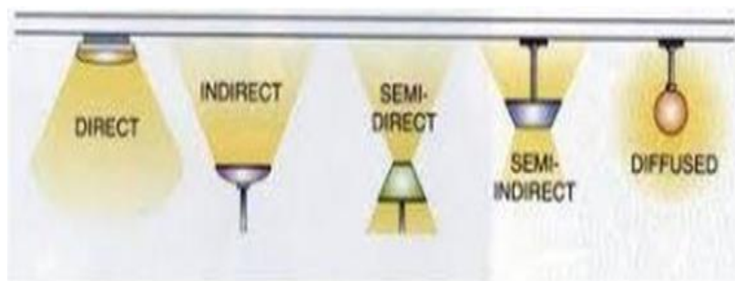
Light distribution techniques

window openings according to their places and the number and size of openings adjusted to the size of the available bathroom and toilet space. At night, adequate artificial lighting is used (Darmayanti and Rucitra, 2016). We recommend that you choose an ambient light lighting system, this system produces lighting with an even light (diffuse). In addition, the interior of the bathroom and toilet for the elderly in addition to using the ambient light system should also use the Mood Light system. The Mood Light system is a lighting system that displays a certain atmosphere in a room. For example, yellow gives the impression of being warm and intimate. While the type of lamp armature selected should choose semi-indirect armature, more than 60% of the lamplight is directed upwards, while at the same time directing 40% of the light downward. In this system, there is practically no shadow problem and glare can be minimized (Mirzah et al., 2017). While the type of lamp that is suitable to be applied to bathrooms and toilets for the elderly is the type of LED lamp.