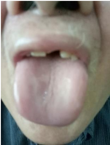
Figure 1. Observation of the patient's tongue

The observation of the patient's blood sugar level at the beginning of therapy was 152. Then it decreased to 112, in week 2 it decreased to 105, in week 3 it decreased to 91, and in week 4 it decreased to 86.