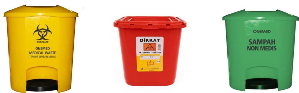
Figure 1.5 Trash Can

The benefits of placing a trash can in the interior of a hospital emergency department are to help visitors to health facilities reduce the feeling of discomfort when they are placed in a waiting position and also that paramedics feel comfortable in providing health services effectively and efficiently. According to Sanwal A, et al. (2015) hospitals must have good hygiene and keep their premises clean (interior). The atmosphere is generally healthy and periodic mopping works. The emergency room has a high standard of cleanliness and a sterilization system so that it does not pose a risk to the community (patients) (Capoor & Bhowmik, 2017). Therefore, hospital waste management (ER) is very important, so the placement of trash bins in the interior of the ER is based on the type of waste as shown in Figure 1.5 below: