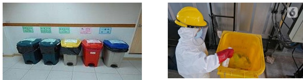
Figure 1.6 Storage and Transport

Storage and transportation of hospital waste, in general, must meet the following requirements: